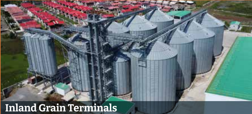
Inland Grain Terminals

We offer our clients personalized, professional solutions with technology and quality guaranteed and backed by decades of experience in executing projects all over the world. The products and services provided by CESCO are primarily grouped into four distinct business areas.