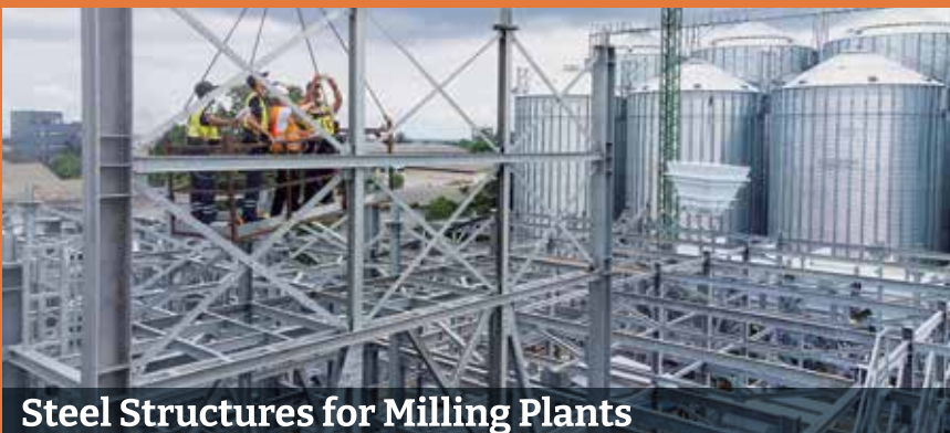
Steel Structures for Milling Plants