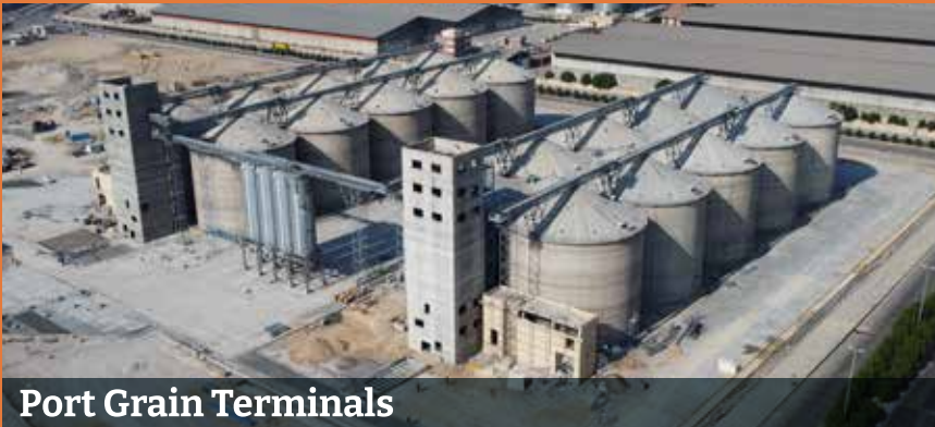
Port Grain Terminals