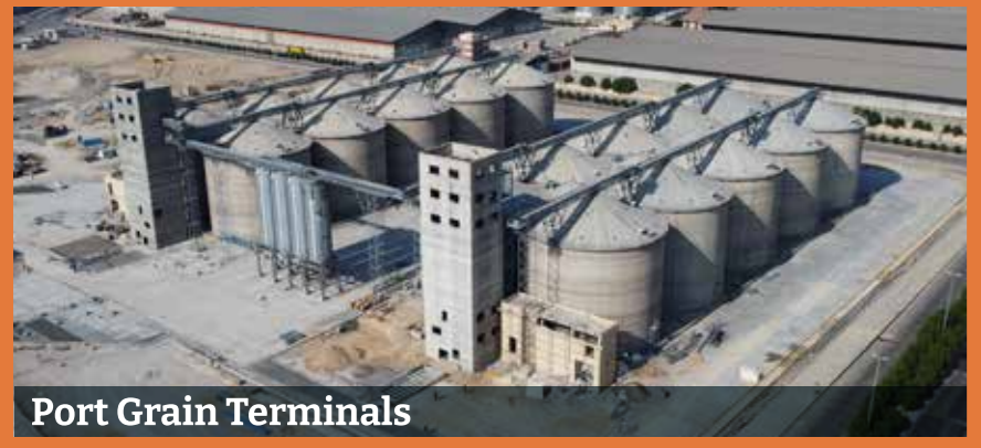
Port Grain Terminals