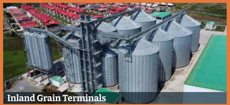
Inland Grain Terminals

We offer our clients personalized, professional solutions with technology and quality guaranteed and backed by decades of experience in executing projects all over the world. The products and services provided by CESCO are primarily grouped into four distinct business areas.