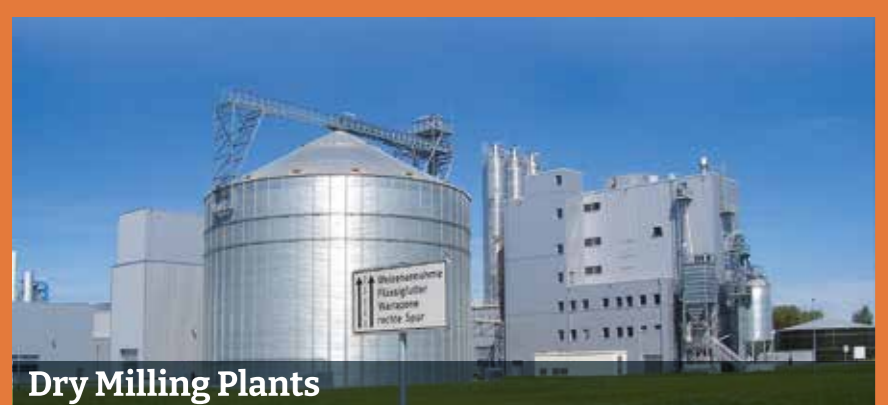
Dry Milling Plants